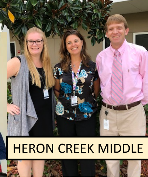
HERON CREEK MIDDLE